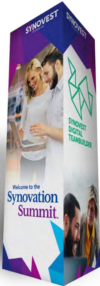
Four sided column wrap