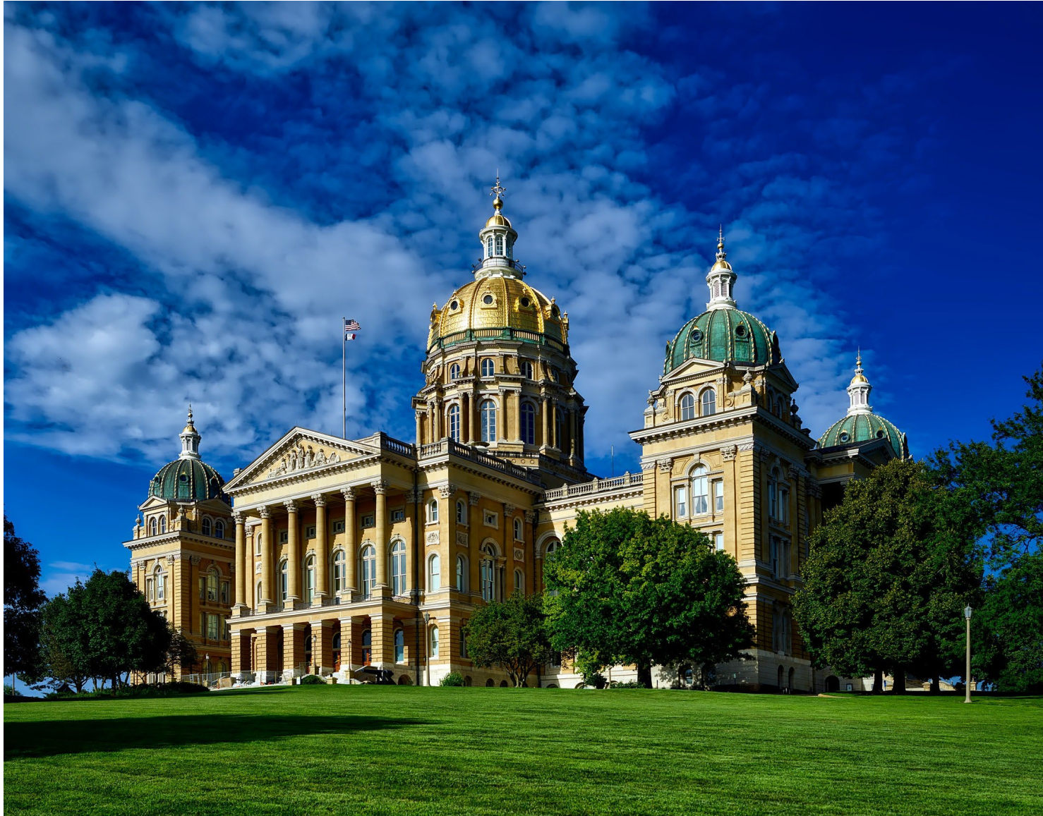
Iowa State Capitol Des Moines, IA