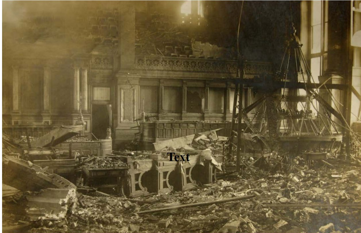
Above: The Iowa House of Representatives Chamber's damage after the fire.