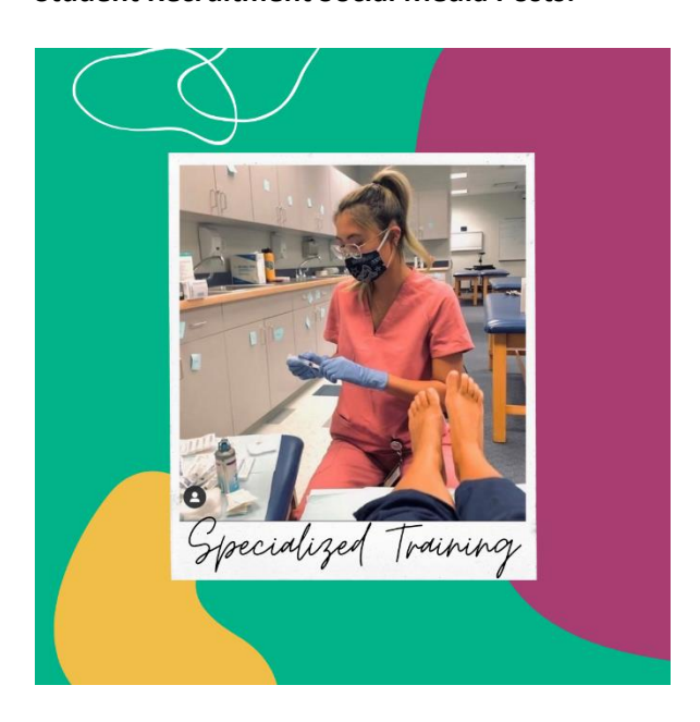
March 2021 Student Recruitment Social Media Posts:

Podiatric medical students prepare for their specialty from day one of podiatric medical school with specialized education and training. There are only nine colleges of podiatric medicine that offer this exclusive training – check out the full list at stepintopodiatry.com.